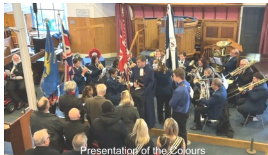
Presentation of the Colours

The annual Remembrance service with the Royal British Legion returned to Trinity Community Church, after the venue change to PNK last year. Following the closure of the Royal British Legion at the top of Kirkhill some changes to the format were introduced.